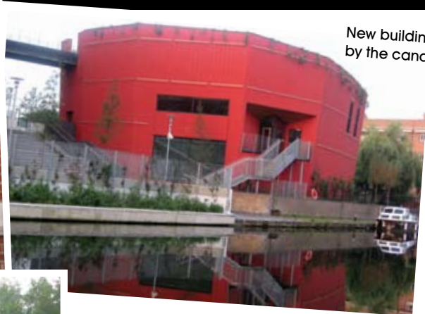
New building by the canal