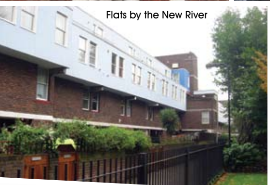
Flats by the New River