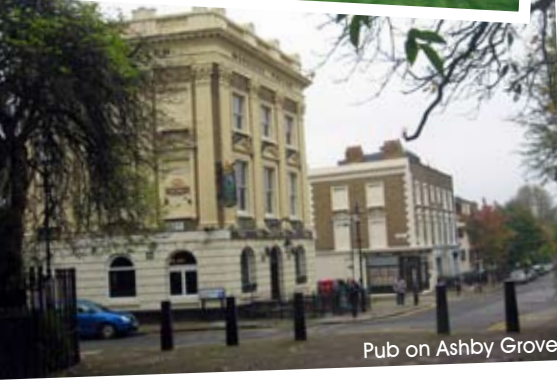
Pub on Ashby Grove