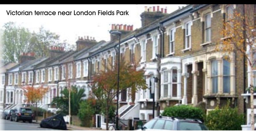
Victorian terrace near London Fields Park