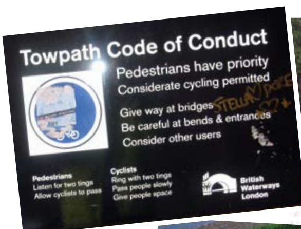
Along the canal