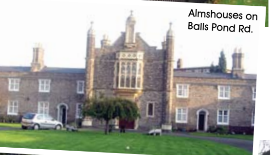
Almshouses on Balls Pond Rd.