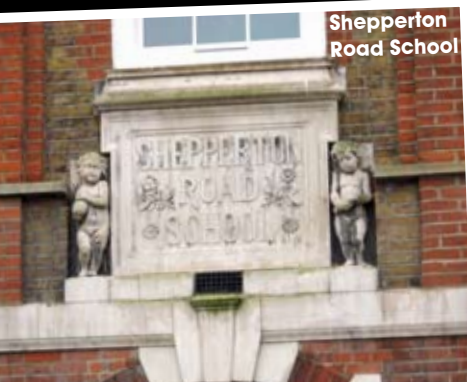
Shepperton Road School