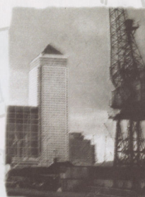
NORTH CANARY WHARF GREENWICH (JLE)

Enjoy your ride on the Docklands Light Railway and the Jubilee Line Extension, which form part of the route, and can be covered by a single ticket if you come in on public transport (which is recommended during the Millennium year).