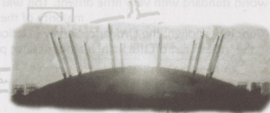
THE MILLENNIUM DOME

An eight-mile walk, visiting eight churches, plus rides on the new Docklands Light Railway (DLR) and Jubilee Line Extension (JLE). There is an optional additional two-mile walk in the Isle-of-Dogs instead of taking the DLR.