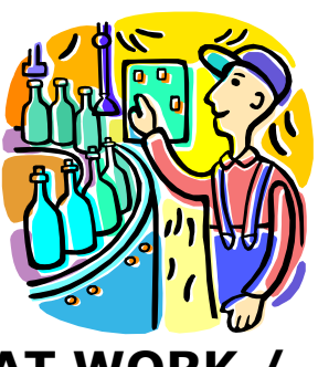
AT WORK / SCHOOL