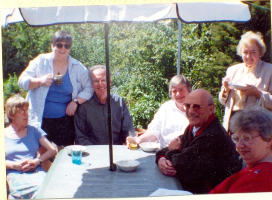
National Council May 02 Birmingham