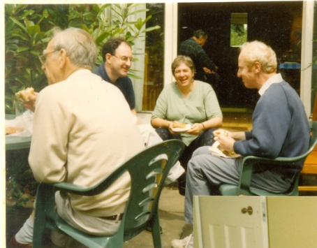
EUTP Nat council July '97