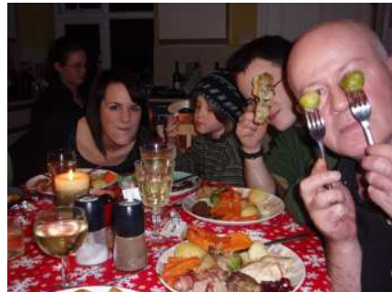
A relaxed meal with friends?