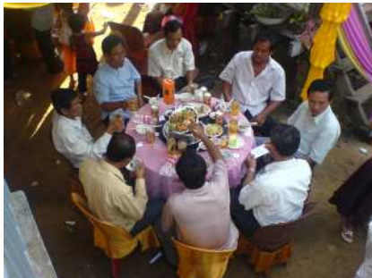
Posh dinner parties?

"Be our guest" was the signature song for Disney's film version of "Beauty and the Beast" and later was used for the advertising campaign for its hotels. The view of hospitality it presents is one of entertainment, of giving the guests a good time and of chasing away the blues. Is this your view of hospitality? Which pictures if any, come closest to your view and why?