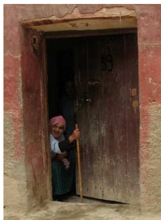
An open door?