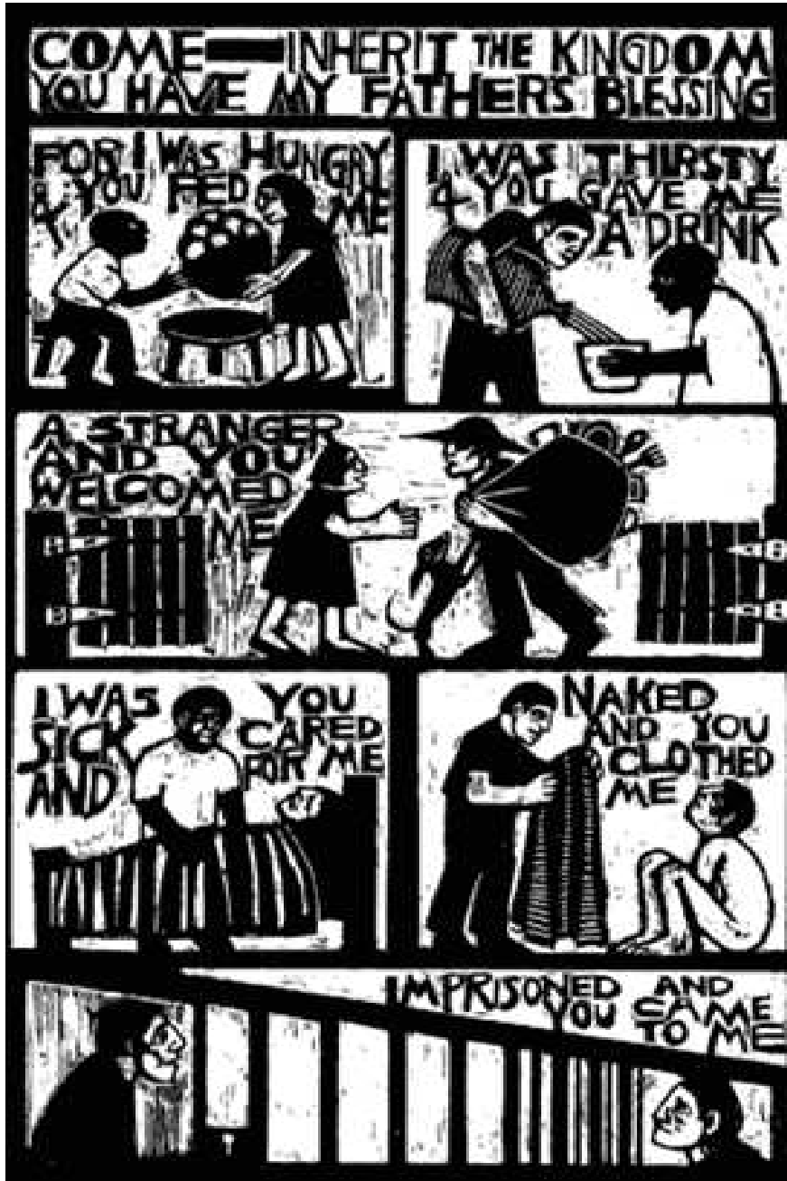
We have been unable to trace the source of this image. An alternative image is provided on page 44.

Consider the picture and the words below. Place yourself in it. Where are you in it? Take time to think about it and then write or draw down your thoughts. Share with the group if you like.