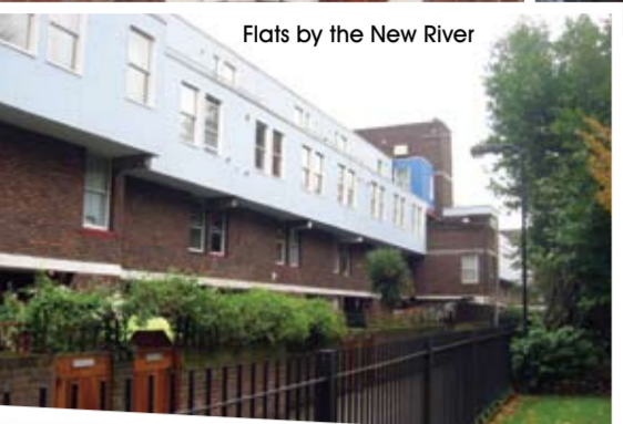
Flats by the New River