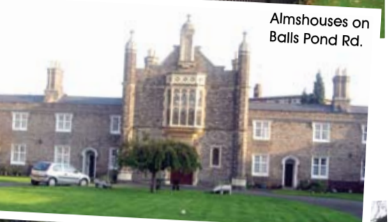
Almshouses on Balls Pond Rd.