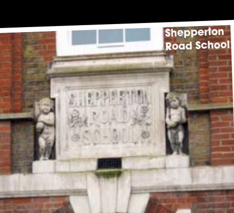
Shepperton Road School