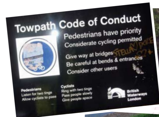
Along the canal