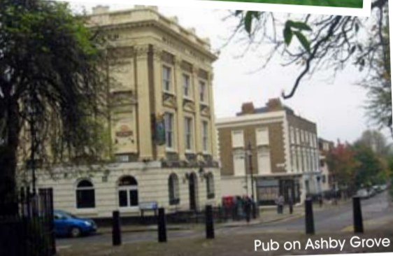
Pub on Ashby Grove