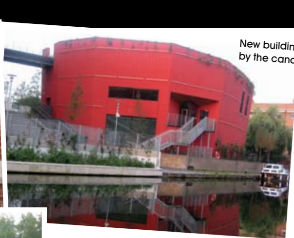
New building by the canal