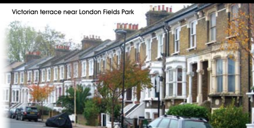
Victorian terrace near London Fields Park